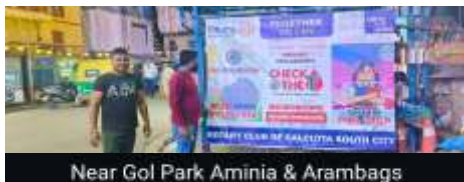
Near Gol Park Aminia & Arambags