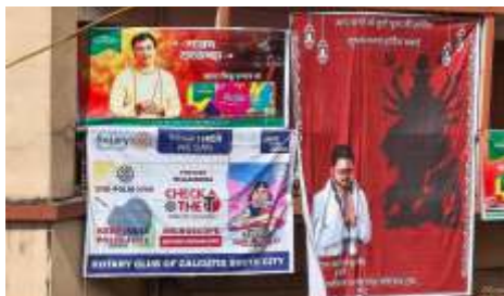
MOITRI SANGHA- Placed at the interception of Deshapriya Park West and Deshapriya Park Road, bang opp. Oudh Restaurant